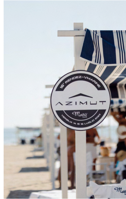
2023 Azimut Yachts x Maitó'