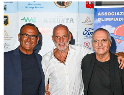
2025 - Olimpiadi del Cuore