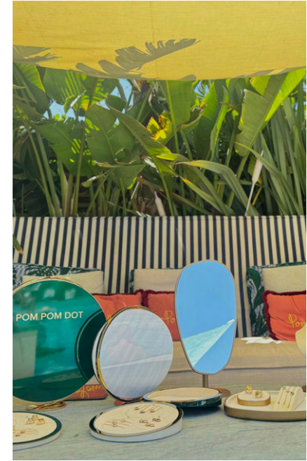
2025 - Pomellato x Maitó'